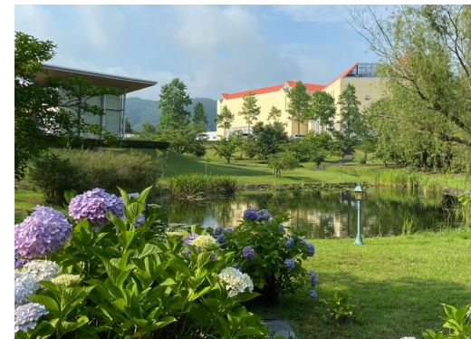
Tokushima Itano Factory of Otsuka Pharmaceutical