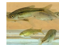
Golden venus chub (Tokushima Prefecture Red List: Critically Endangered)