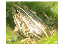
Black-spotted pond frog (Tokushima Prefecture Red List: Endangered)