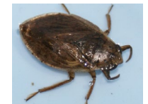
Ferocious water bug (Tokushima Prefecture Red List: Critically Endangered)