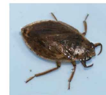
Giant water bug (Critically Endangered)