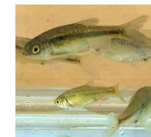
Golden venus chub (Critically Endangered) (from the Tokushima Red List)