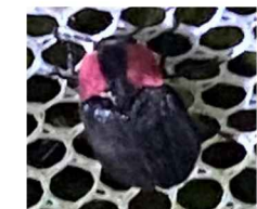
Japanese Heike firefly