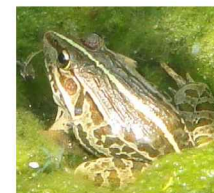
Black-spotted pond frog (Endangered)